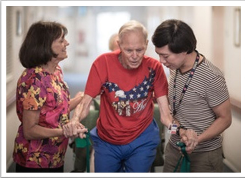
Nine State Veterans' Homes