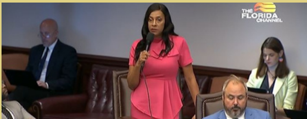
Senator Shevrin Jones and Senator Rosalind Osgood debate the union-busting bill.