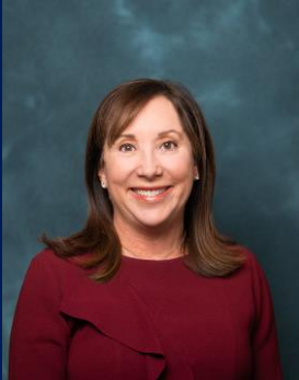
STATE SENATOR LORI BERMAN Senate Democratic Whip

THE OFFICIAL PUBLICATION OF SENATE DISTRICT 31