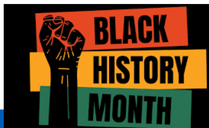
Senator Tina Polsky

A handwritten signature in black ink, appearing to read 'Tina Polsky', is written over a light blue background.