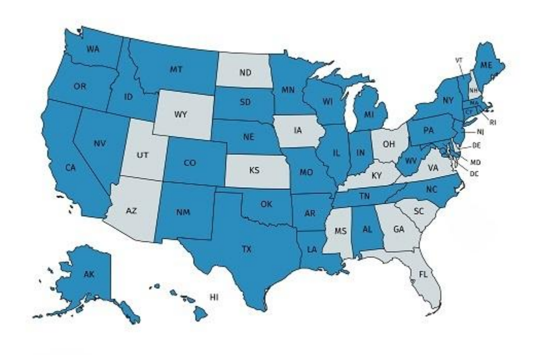
Note: States shaded in blue have established federally-subsidized GAP programs