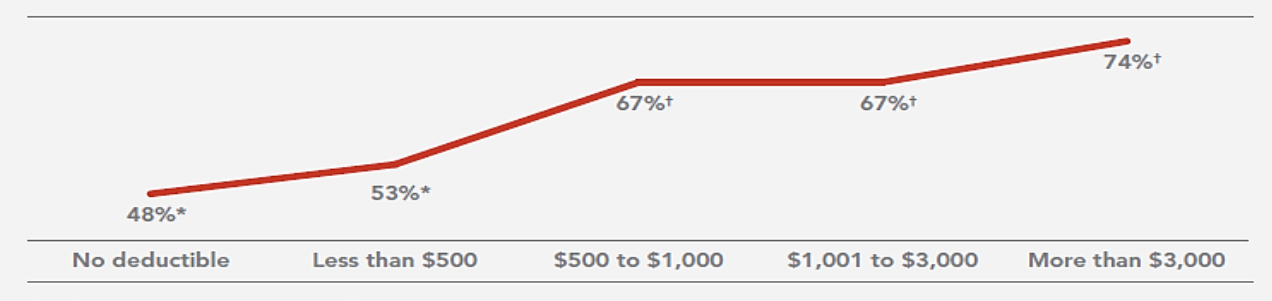
Figure 2: Percent who say they have tried to find price information before getting care, by deductible amount: