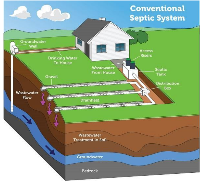
Please note: Septic systems vary. Diagram is not to scale

Onsite sewage treatment and disposal systems (OSTDS), commonly referred to as "septic systems," generally consist of two basic parts: the septic tank and the drainfield.<sup>56</sup> Waste from