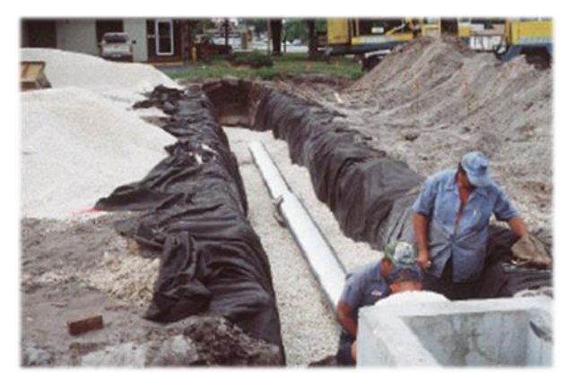
Underground Exfiltration Trenches