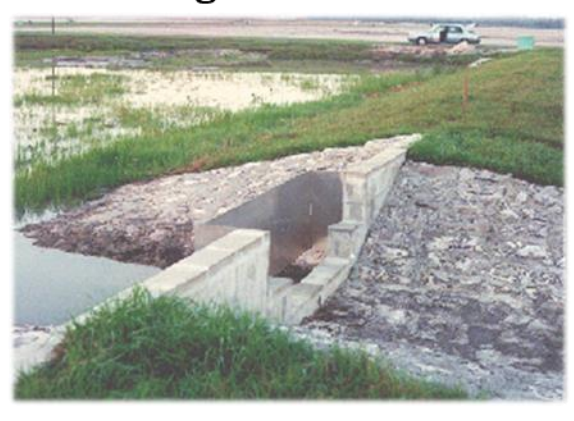
"Wet" Detention Ponds