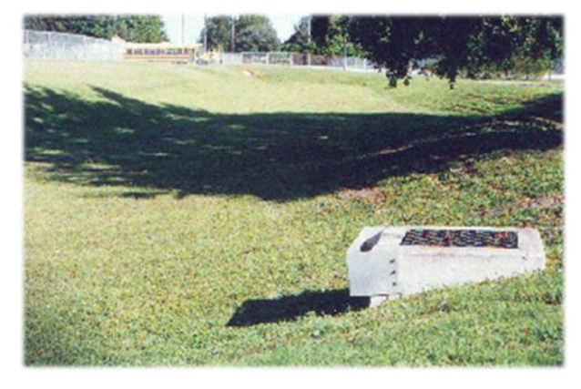
"Dry" Retention Ponds