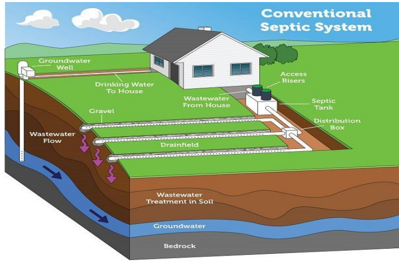
Please note: Septic systems vary. Diagram is not to scale.

The Blue-Green Algae Task Force recommended that the DEP develop a more comprehensive regulatory program to ensure that OSTDSs are sized, designed, constructed, installed, operated, and maintained to prevent nutrient pollution, reduce environmental impact, and preserve human health. The task force also recommended more post-permitting septic tank inspections.<sup>10</sup>