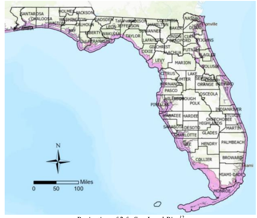
Projection of 2 ft. Sea Level Rise<sup>12</sup>

Over 5 million structures are estimated to be affected by flooding under a two-foot sea level rise scenario. The estimated value of these at-risk properties exceeds $576 billion.<sup>13</sup>