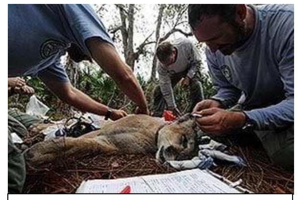
A sedated Florida panther is fitted with a radio collar to allow researchers to track this individual's movements.

The importance of surveying and monitoring means that state fish and wildlife managers are constantly collecting data showing site-specific location information on threatened and endangered species.<sup>36</sup> For example, FWC biologists track Florida panthers with radio collars.<sup>37</sup> The locations of panthers collared with VHF transmitters are monitored two times per week by aircraft, while panthers fitted with GPS-transmitting radio collars can be constantly monitored.<sup>38</sup> FWC and the U.S. Fish and Wildlife Service also collect location data on panthers from multiple trail camera locations.<sup>39</sup>