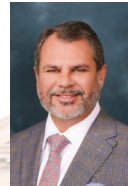
LEEK (R) District 7