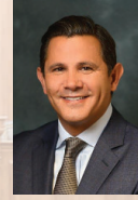
PIZZO (D) District 37 MINORITY LEADER