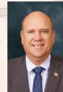
TRUENOW (R) District 13