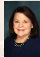
BURTON (R) District 12