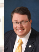
FINE (R) District 19