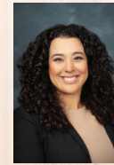
GALATAYUD (R) District 38