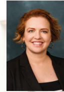
ARRINGTON (D) District 25