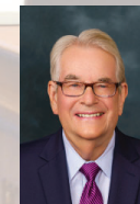
GAETZ (R) District 1