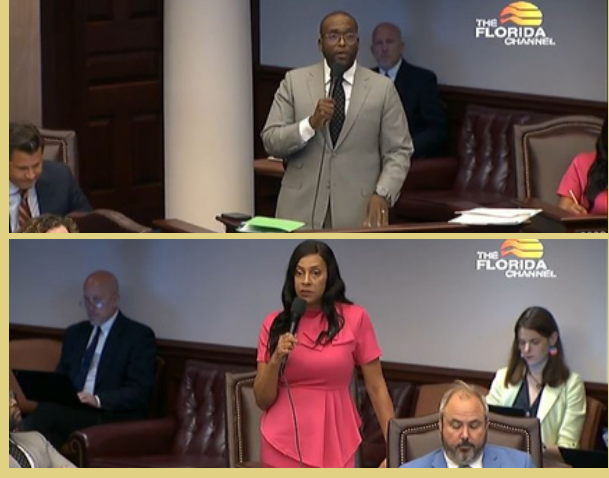
Senator Shevrin Jones and Senator Rosalind Osgood debate the union-busting bill.