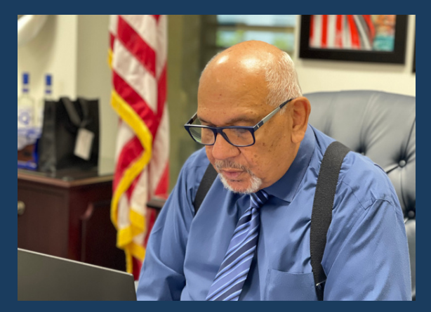
Senator Victor Torres speaking to <u>WESH News</u> about the House member's comments