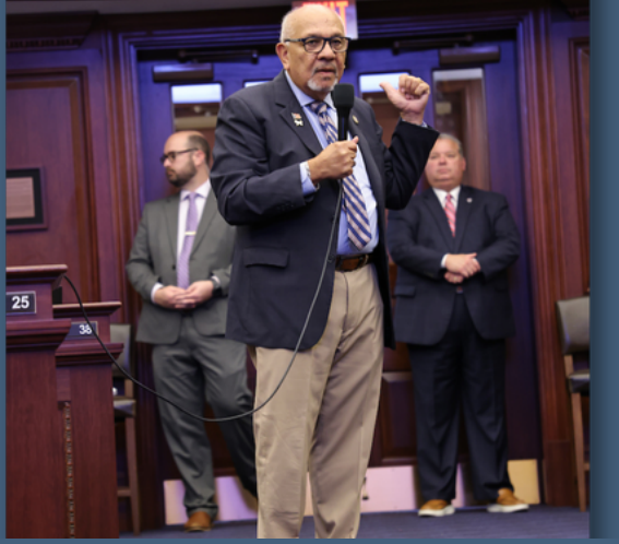
Senator Victor Torres defends his amendment on the Senate floor.

The Florida Senate approved <u>SB 1718</u> - an anti-immigrant bill pushed by the Governor as he continues to use vulnerable people as pawns in his political game. The bill criminalizes humanitarian aide and stifles economic needs for Florida.