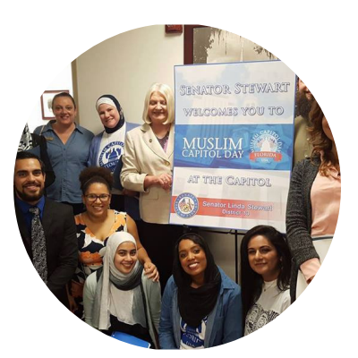
Constituents visit for Muslim Capitol Day

With Congressman Darren Soto for Earth Day