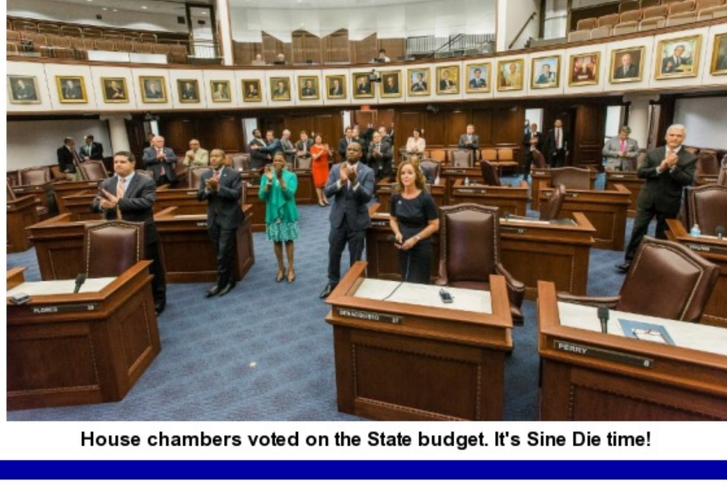
House chambers voted on the State budget. It's Sine Die time!