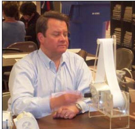
Pictures from Election Science Institute analysis of a Cuyahoga County, Ohio election. Count of votes from touch screen printers not permitted under this bill.