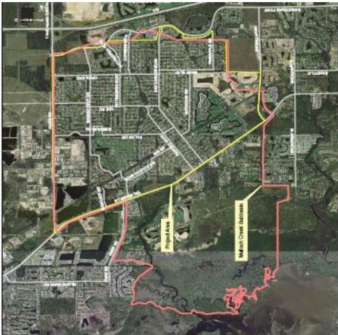
East Mulloch Drainage District