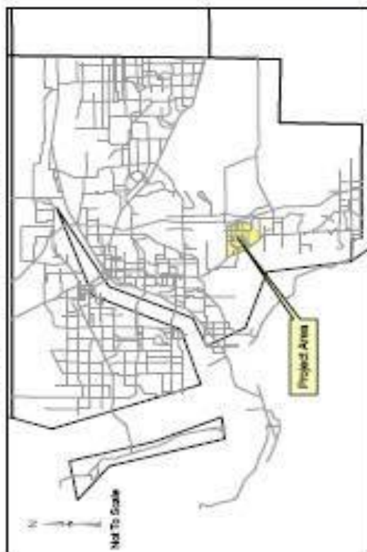
Lee County, Florida