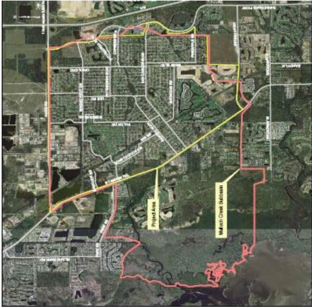
East Mulloch Drainage District