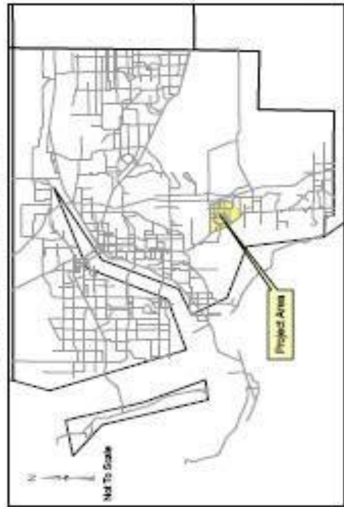
Lee County, Florida