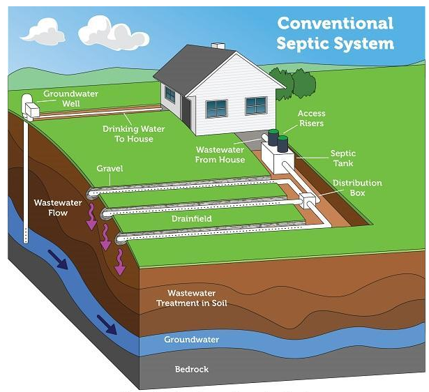
Please note: Septic systems vary. Diagram is not to scale.

where aerobic bacteria continue deactivating the germs. The drainfield also provides filtration of the wastewater, as gravity draws the water down through the soil layers.<sup>80</sup>