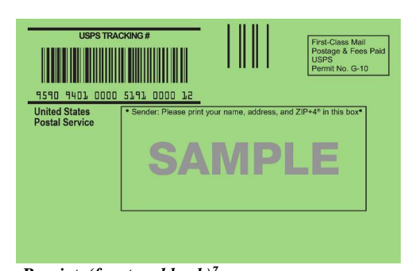
PS Form 3811, Domestic Return Receipt (front and back)<sup>7</sup>