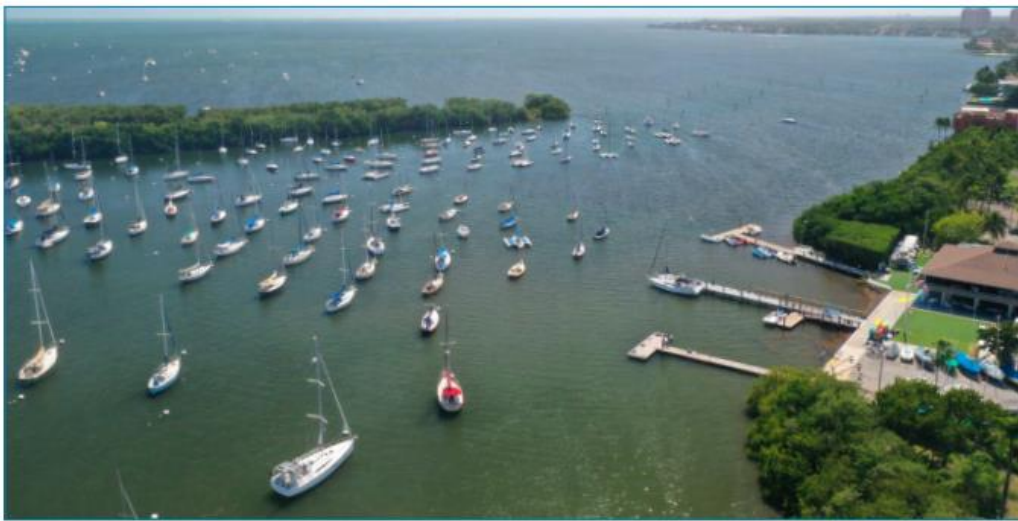
A photo taken at the Dinner Key and Coconut Grove Sailing Club mooring fields. Vessels can be seen anchored outside of the mooring field.

The FWC's Long-Term Stored Vessel Study found that a correlation exists between the number of "long-term stored vessels" and the incidence of derelict vessels. 39 The study was unable to conclude the extent to which long-term stored vessels contribute to the number of derelict vessels because of the absence of tracking data. 40 As part of the study, the FWC identified 691 popular overnight anchoring locations. 41 Of these unmanaged anchoring areas, 319 were used primarily for long-term storage, 243 were used primarily by transient cruising vessels for short overnight stays, and 129 were used for an indeterminate mixture of storage and cruising. 42