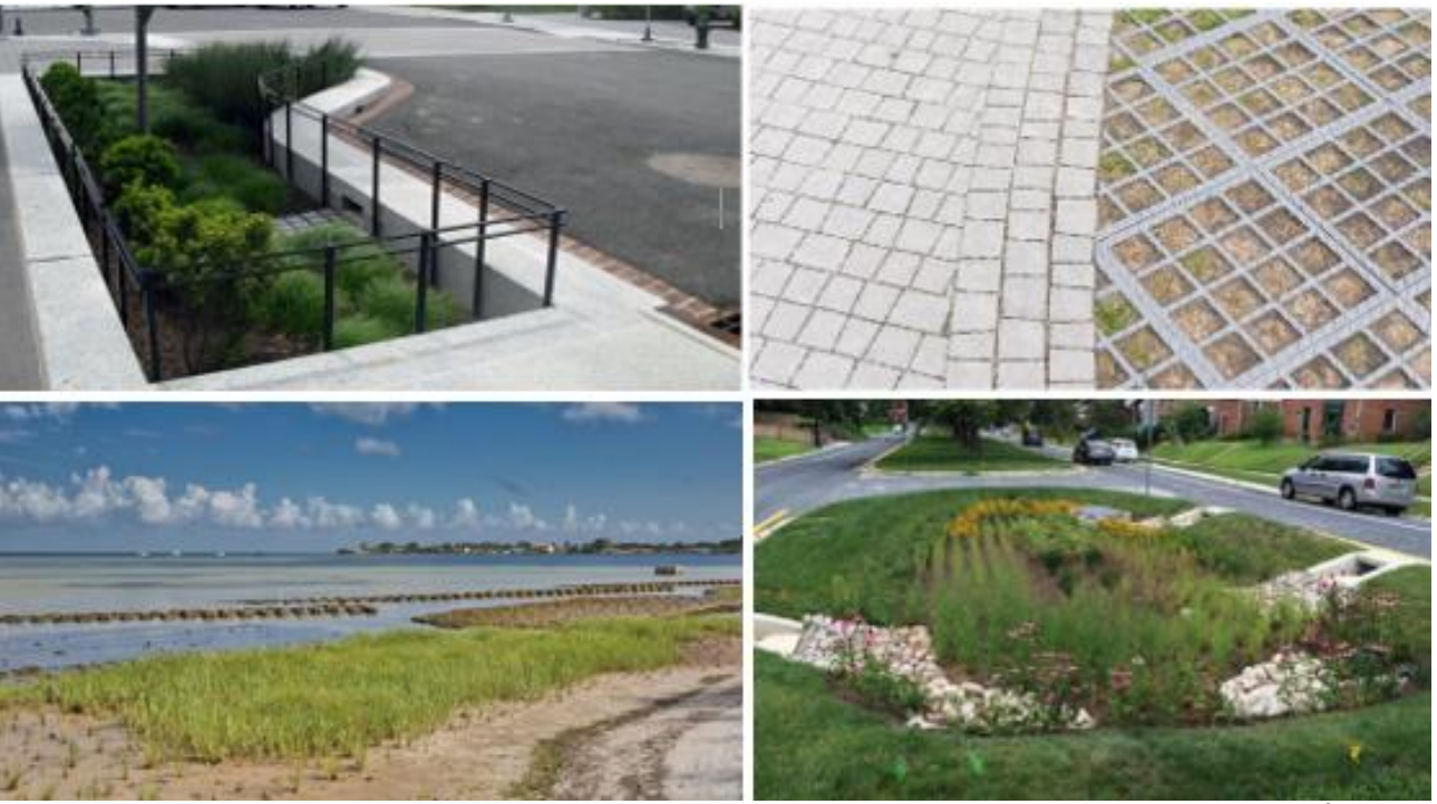
Stormwater Planter, Permeable Pavement, Living Shoreline, and Bioretention<sup>9</sup>