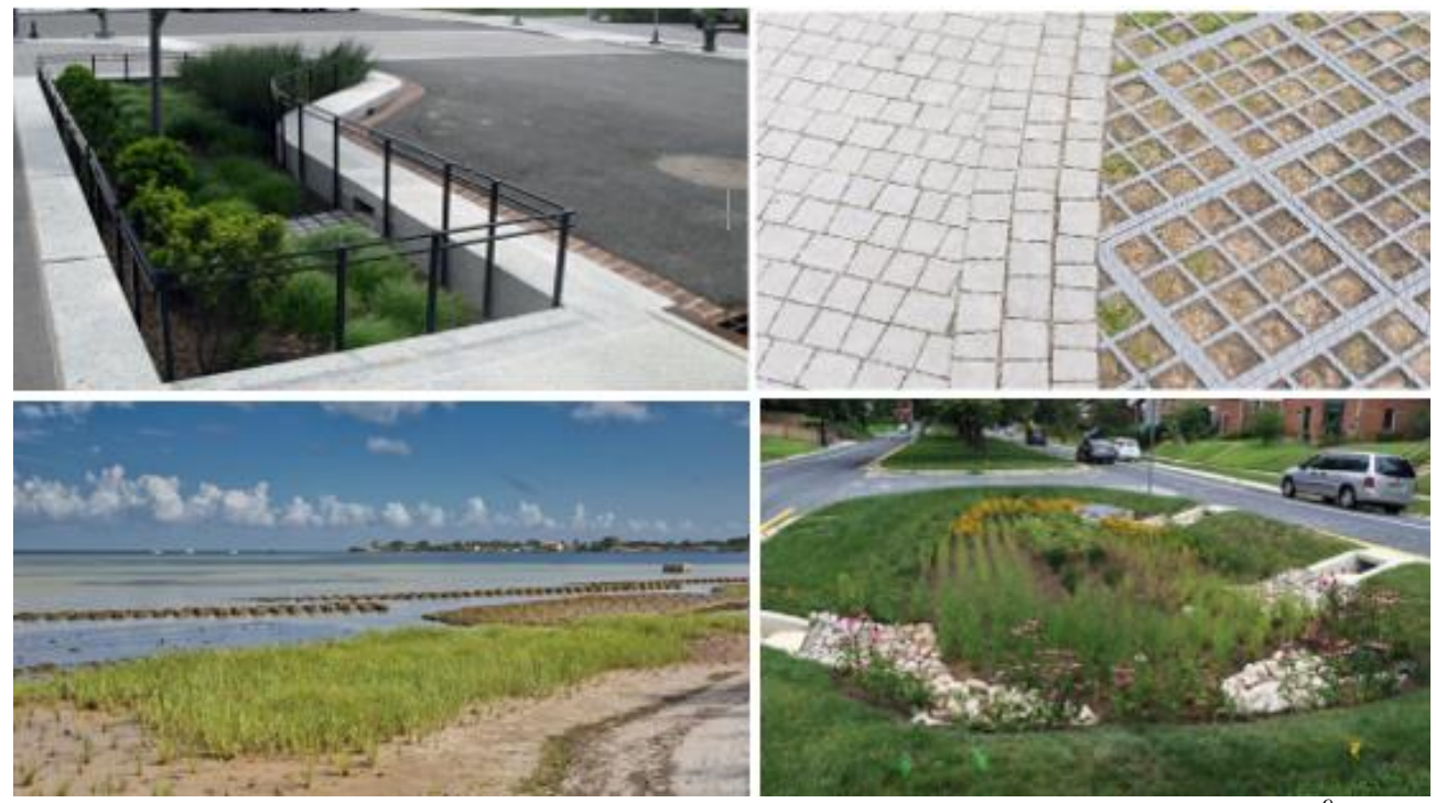
Stormwater Planter, Permeable Pavement, Living Shoreline, and Bioretention<sup>9</sup>