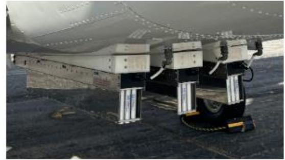
Ejectable Flares 17

Other cloud seeding approaches remain emergent or under development, including the use of balloons, drones, or plane-mounted electrostatic nozzles. 18 In the latter technique, the nozzles charge water particles which are then carried up into the clouds and distributed by updrafts. 19 The particles, which have the opposite electrical charge of the water in the clouds, act as cloud condensation nuclei and trigger the natural rainmaking process. 20