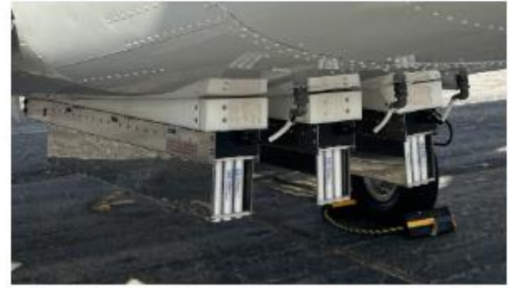
Ejectable Flares 17

Other cloud seeding approaches remain emergent or under development, including the use of balloons, drones, or plane-mounted electrostatic nozzles. 18 In the latter technique, the nozzles charge water particles which are then carried up into the clouds and distributed by updrafts. 19 The particles, which have the opposite electrical charge of the water in the clouds, act as cloud condensation nuclei and trigger the natural rainmaking process. 20