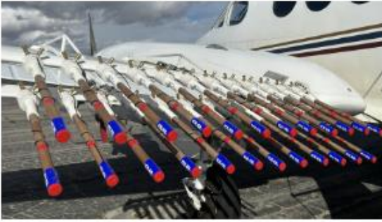
Wing-Mounted Burn-In-Place Flares 16

windward side of mountains. 12 These generators, operated either manually or remotely, release silver iodide particles into the air; wind then transports the particles upward into the clouds where they facilitate the freezing of water molecules. 13 This process is typically used to increase snowfall over targeted mountain areas. 14 In airborne operations, aircrafts disperse the seeding agent into or above the clouds using pyrotechnic flares. 15