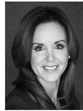
Lizbeth Benacquisto (R) Fort Myers District 27