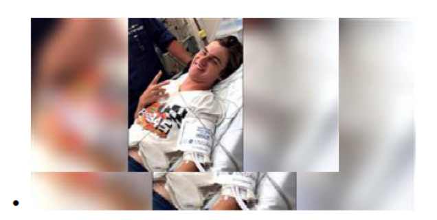
19-year-old recovering from shark bite at North Carolina beach